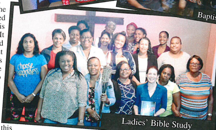
Ladies' Bible Study

topic specifically with our teens, young adults, and married couples. However, because Carnival is viewed by many as simply part of Trinidad's culture, there are many people who struggle with temptation and put themselves in compromising situations during this time. "But thanks be to God who giveth us the victory through our Lord Jesus Christ!"