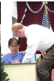
Our Filipino members